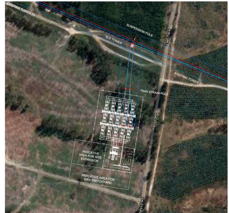
Concept of 220kV terminal station