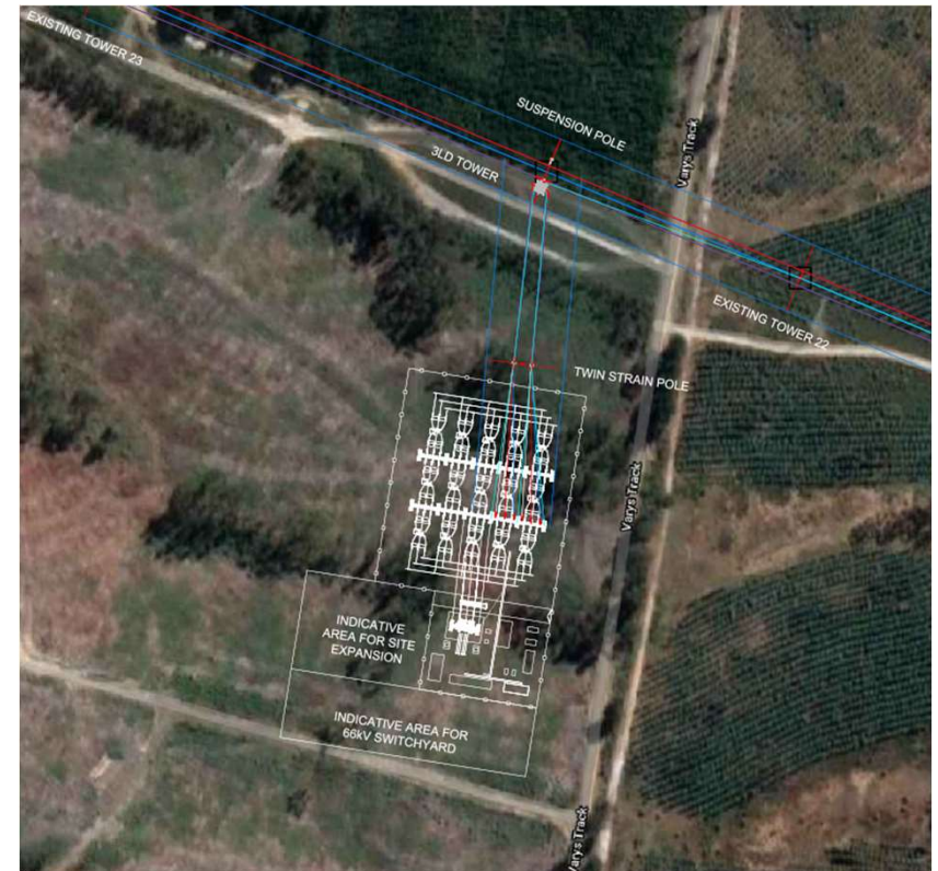
Proposed 220kV terminal station